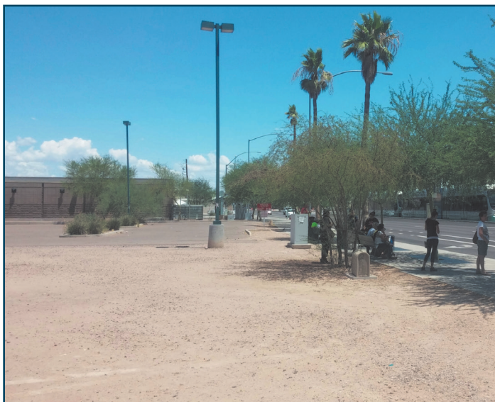
Site of the defunct Sycamore Station development, one of many failed projects still cited as "economic development" along the light rail.

Most of the plans for these developments were probably made before the 2008 crash, when speculators had driven up prices for Phoenix-area condominiums and other housing. Some of the developments may have been completed after the crash because contracts had been signed and it was too late to stop despite the dramatic drop in condominium prices or because subsidies made it worthwhile for developers to complete the projects despite the fall in housing